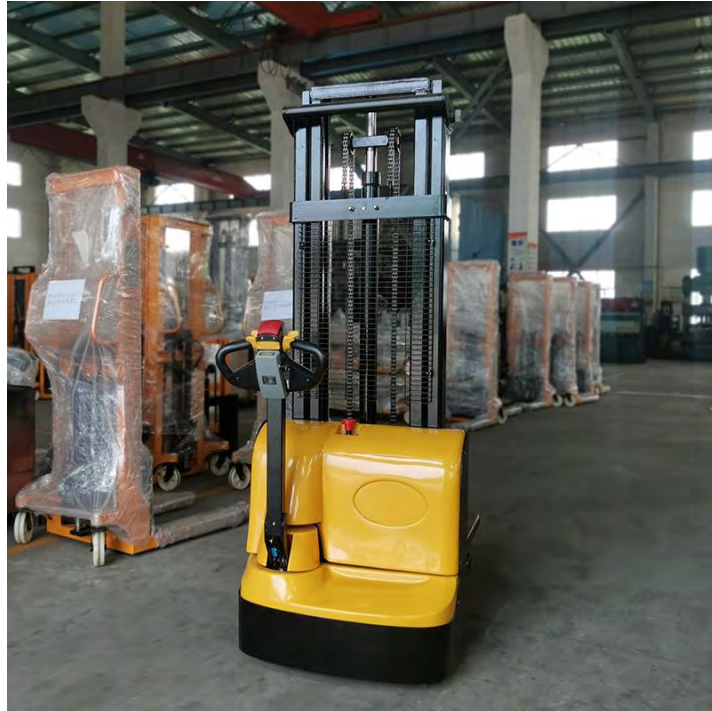
Photo of machine